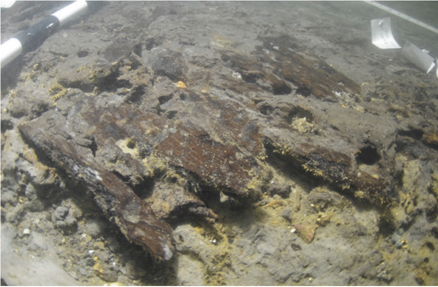
Fig. 21.5 Edge of a platform or collapsed structure consisting of tangentially split timbers alongside radially split round-wood