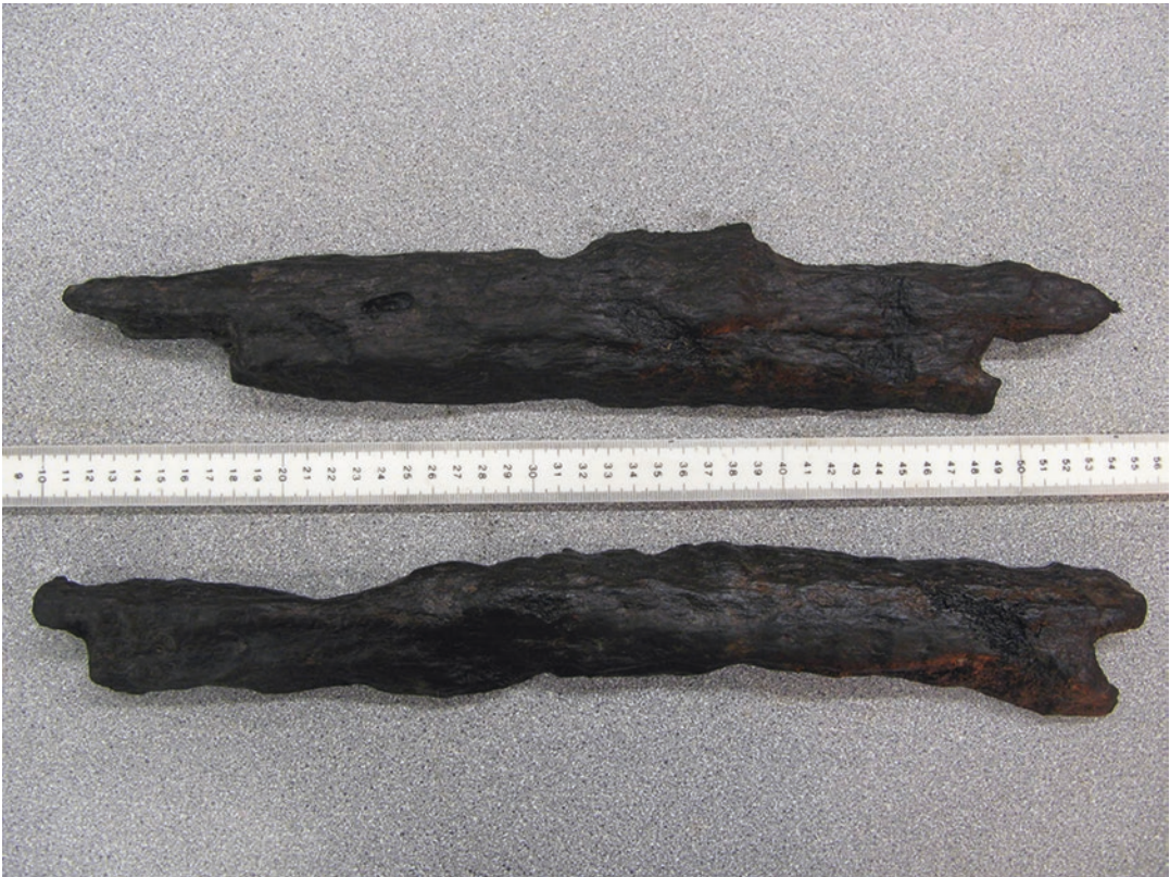
Fig. 21.6 Split and trimmed timber from the platform or collapsed structure at Bouldnor Cliff