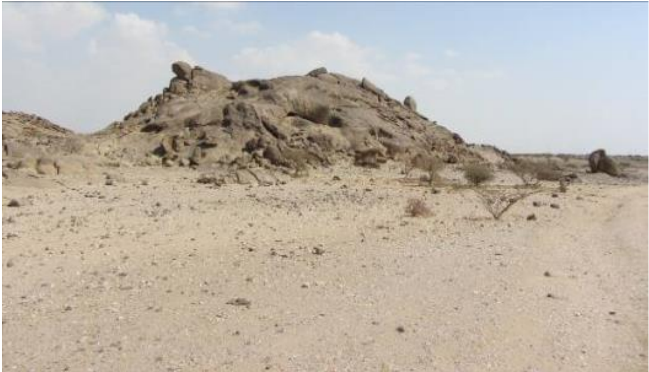
Figure 13. WP045 - the easternmost end of the linear granite outcrop, looking NE. Lithics of multiple types and raw materials were found across the surface around the base of the outcrop. Photo by Robyn Inglis, 27 November 2012.

WP045. Multi-period lithics on a range of raw materials including basalt, chert, and granite, and potentially quartz were found around the base of a linear granite jebel of basalt (Figure 13). This is located to the east of the Hajambar/Muhayil road in an otherwise flat landscape dominated by deflated surfaces dominated by quartz but including other raw material.