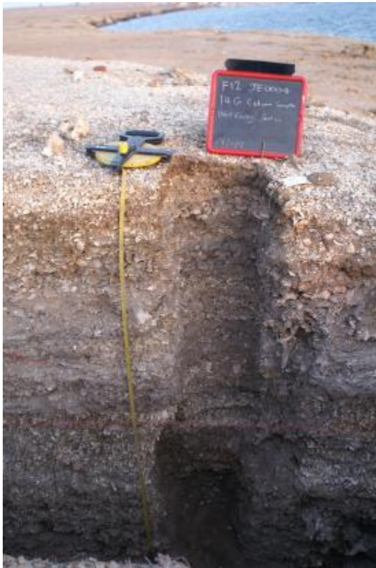
Figure 7. West facing section of Janaba 4, after removal of the column samples from 14G. The sign board is 30cm wide (excluding frame). Photo by Geoff Bailey, 17 November, 2012.

near the thickest part of the mound at its centre; and 14G, which samples a wider range of shell layers with differing characteristics nearer the north end of the section (Figures 7, 8 and 9).