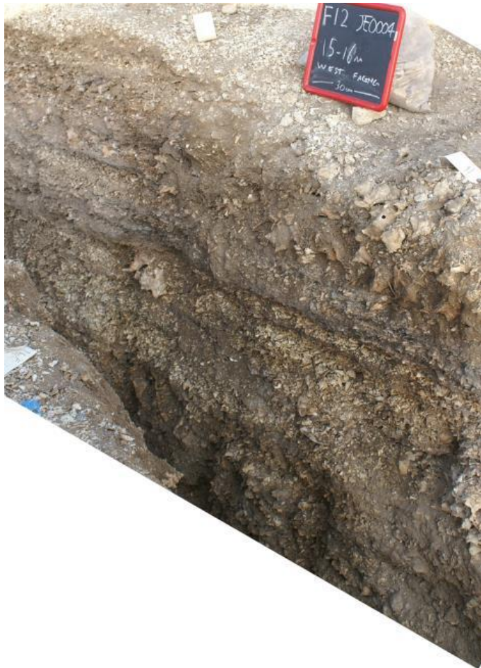
Figure 4. Part of the west facing section of Janaba 4, after excavation of the central section of the trench down to the bedrock. The horizontal banding of layers with clean Strombus fasciatus shell alternating with dark ashy layers is clearly visible in mid-section. At the top right of the section, there is a layer dominated by large gastropods of Pleuroploca sp. and Chicoreus sp., with an earthy matrix. This layer rests unconformably on the horizontal layers of small shells and ash, and lenses out towards the left of the image. The sign board is 30cm wide (excluding frame). Photo by Geoff Bailey, 14 November 2012.

The sections clearly demonstrate the varied nature of the deposits in the mound and the nature of their accumulation and stratification. In the central part of the mound the deposits show a near-horizontal banding with thick layers of shell dominated by the small gastropod, Strombus fasciatus , alternating with thinner ash-rich layers, often rich in fish bone, which show up as black bands in the section (Figure 6). Higher up in the section, it is clear that the deposits