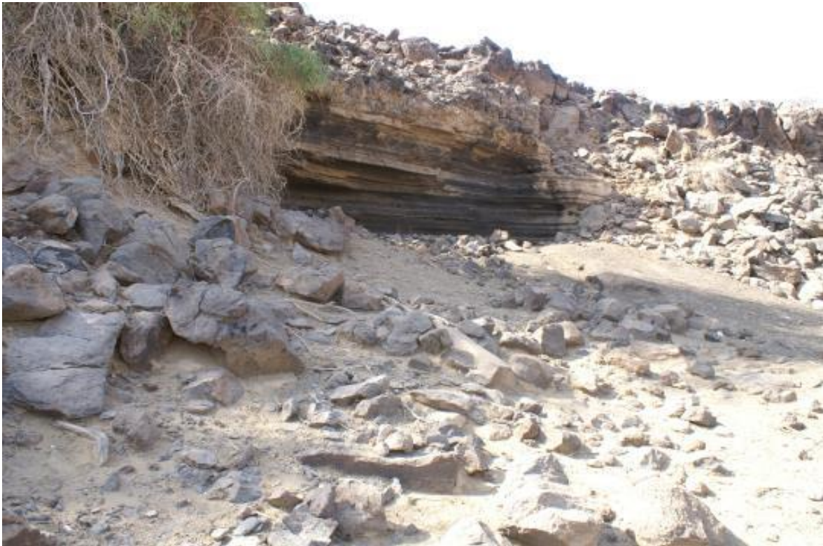
Figure 15. Rockshelter formed in a sandstone cliff capped by a lava flow on the edge of a wadi near As Shugaig at Waypoint 049. Photo by Geoff Bailey, 27 November 2012.