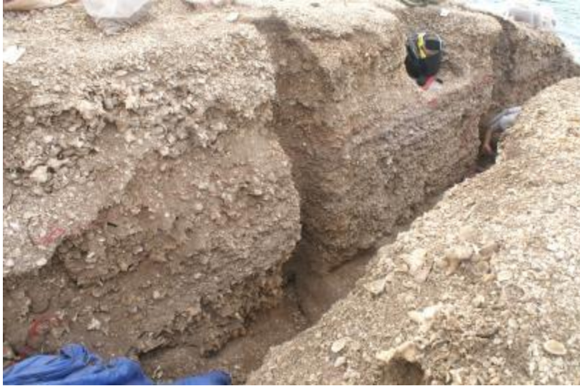
Figure 9. General view of west-facing section of Janaba 4 after removal of column samples, looking towards the South. Note the layer dominated by large gastropods ( Pleuroploca sp., Chicoreus sp.) at the top left of the section and thickening towards the left of the image. Photo by Geoff Bailey, 21 November 2012.