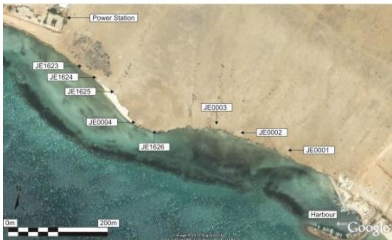
Figure 11. Google Earth image showing the location of the Janaba 4 shell mound and the other shell mounds in the vicinity, from which samples were collected. Map prepared by Matthew Meredith-Williams.