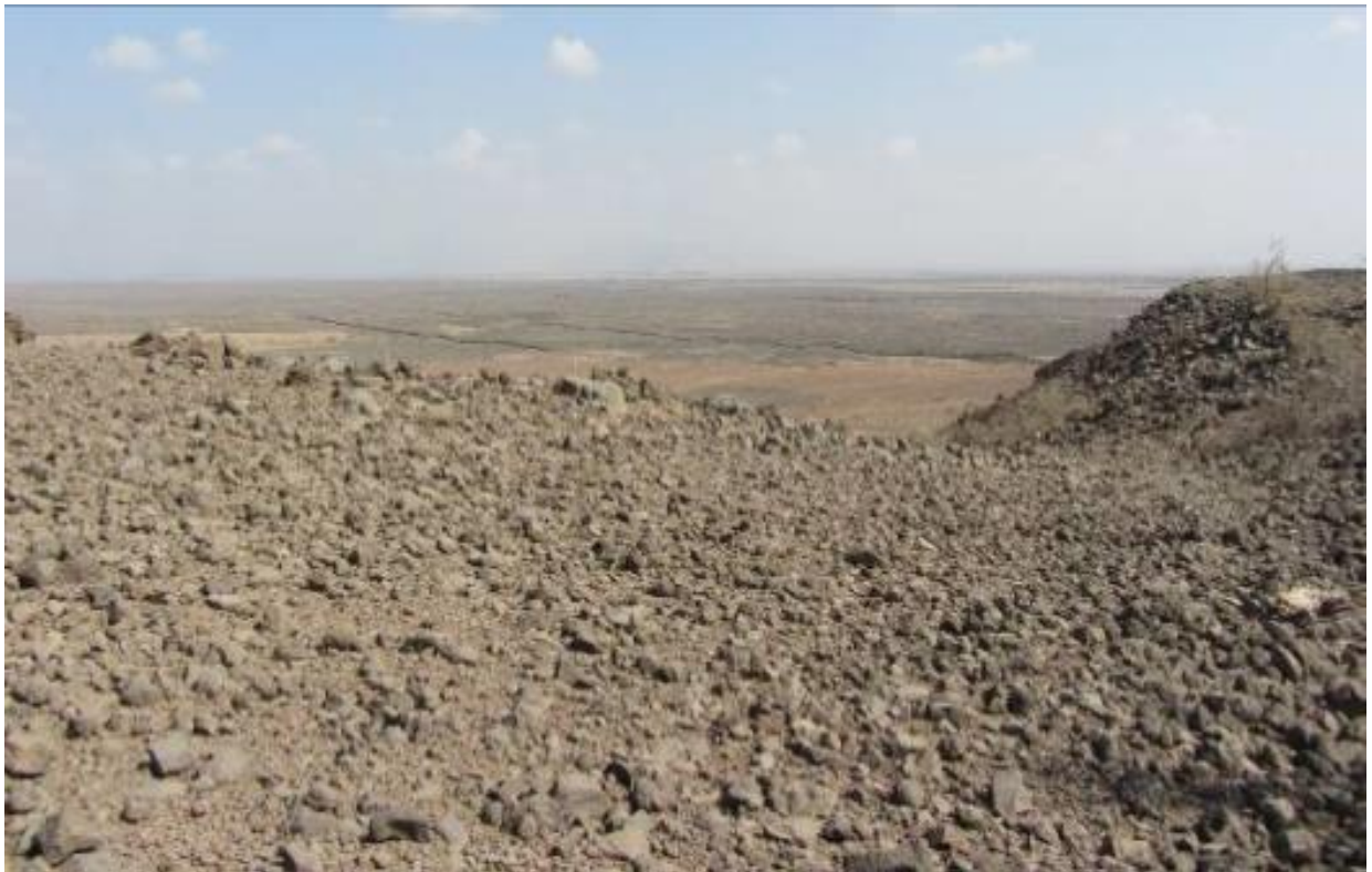
Figure 12. WP041, looking NE - lithics were concentrated in an area of particularly fine-grained basalt boulders and cobbles on the flat surface of the jebel in the foreground. Photo by Robyn Inglis, 27 November 2012.

The lava flows in the north of the Jizan region, near Al Birk and As Shugayig, contain sites previously identified by the Comprehensive Archaeological Survey Program, mainly along the edges of the lava flows. The survey of this area identified Palaeolithic artefacts at a number of sites in the area in different settings (Figure 1). These include the following: