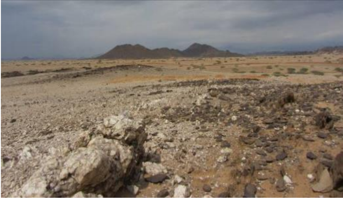
Figure 14. View from WP056 looking N towards WP057 and 055, visible as dark linear features on the otherwise relatively flat landscape. Photo by Robyn Inglis, 29 November 2012.