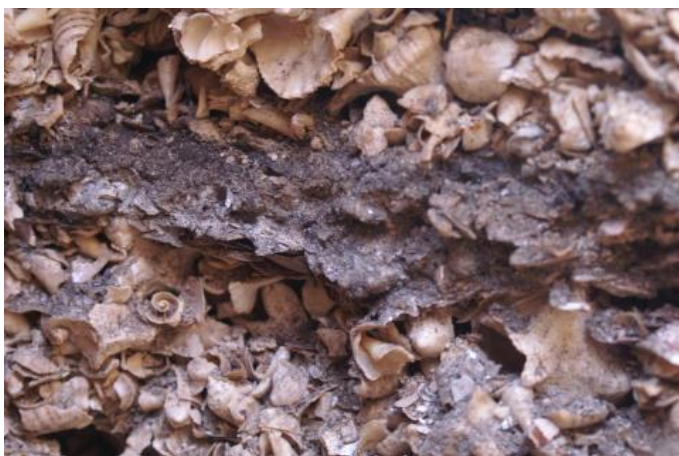
Figure 6. Close-up of west-facing section of Janaba 4 in 11G, showing layers of clean shell separated by a dark ash-dominated layer. Photo by Geoff Bailey, 18 November, 2012.

For the column sampling, we selected two columns in the west-facing section, representing the deepest parts of the mound with the most complete and representative sequence of layers: 11G