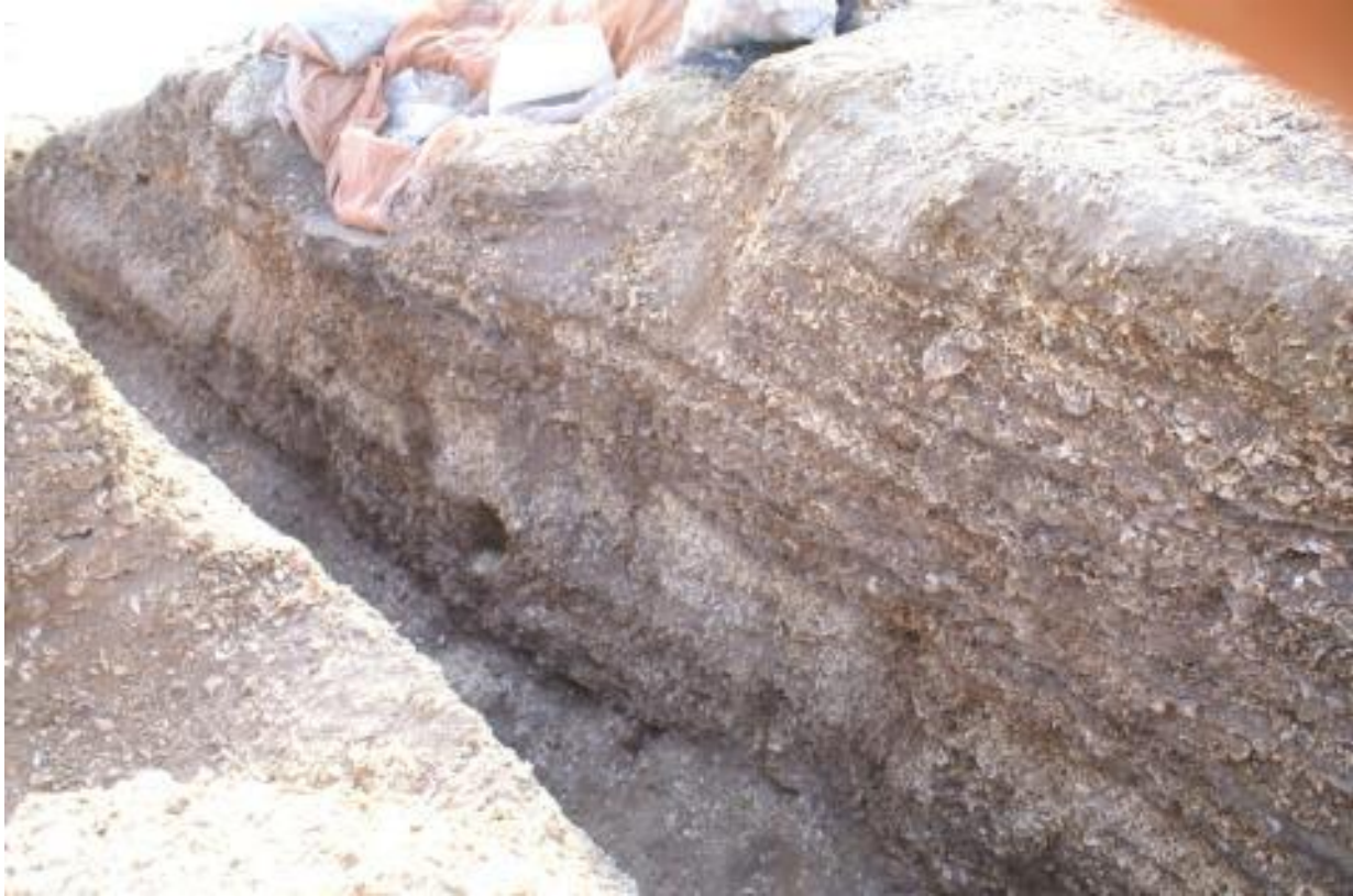
Figure 5. General view of the east facing section of Janaba 4, looking towards the South. The horizontal banding of Strombus -rich layers and ash lenses is clearly visible. Photo by Geoff Bailey, 14 November 2012.

have become truncated by slumping or removal of deposits on the slope of the accumulating mounds, particularly near its edge, with overlying accumulations of shells, often dominated by the larger gastropods, such as Pleuroploca pleuroploca and Chicoreus trapezium .