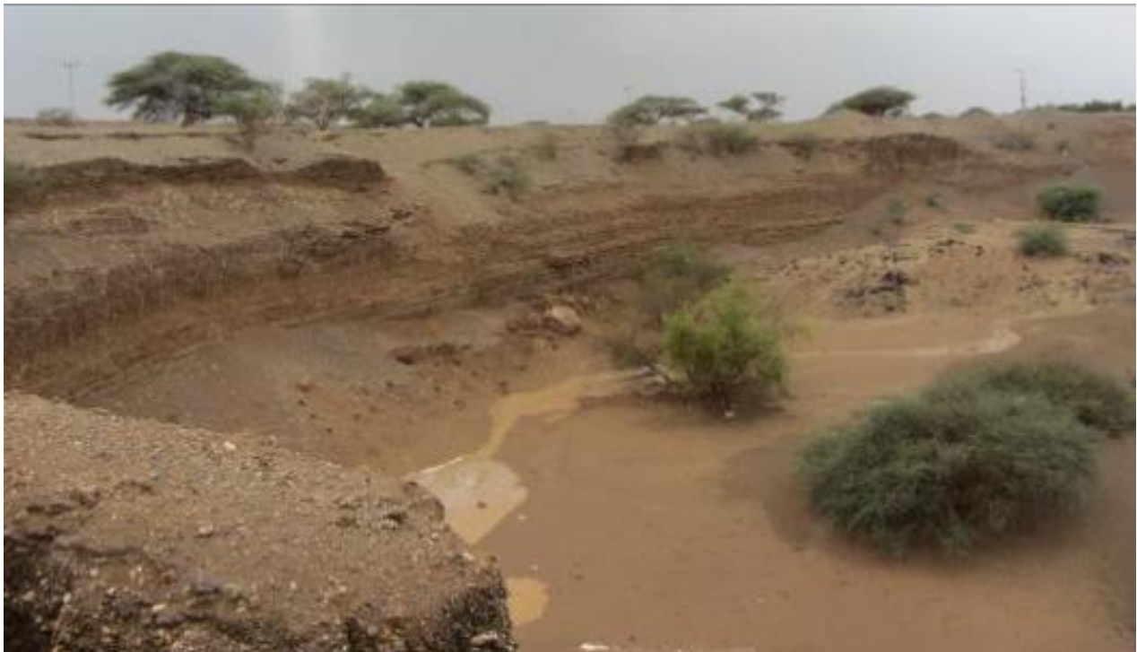
Figure 16. Quarry at WP304, 8km N of Hajambar. Note in-situ lava to the centre right of the photos, as well as the extensive horizontally-laminated potential lake sediments at the base of the quarry cut which were sampled for palaeoenvironmental analysis and dating. Photo by Robyn Inglis, 29 November 2012.

This quarry was located in the May–June 2012 survey c. 8km North of Hajambar on the Hajambar/Muhayil road, and contains a series of stratified deposits, the lowermost of which were initially interpreted as lake sediments (Figure 16). On this occasion, we sampled these lower sediments for additional analysis. Three dating samples were removed from the section for OSL dating, as well as a column of 68 small bulk sediment samples for sedimentological analyses, along with 13 intact blocks for analysis by soil micromorphology. A mixture of stone tool types and materials, predominantly quartzite were recovered from various unstratified locations within the quarry, although two quartzite flakes were removed from the most recent unit of wadi deposits at the north end of the quarry.