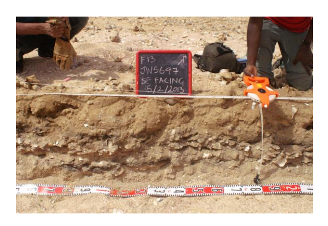
Figure 17. Section through JW5697. The generally sandy matrix and the presence of beach deposits at the base of the section are visible. Photo by Niklas Hausmann, 5 February, 2013.