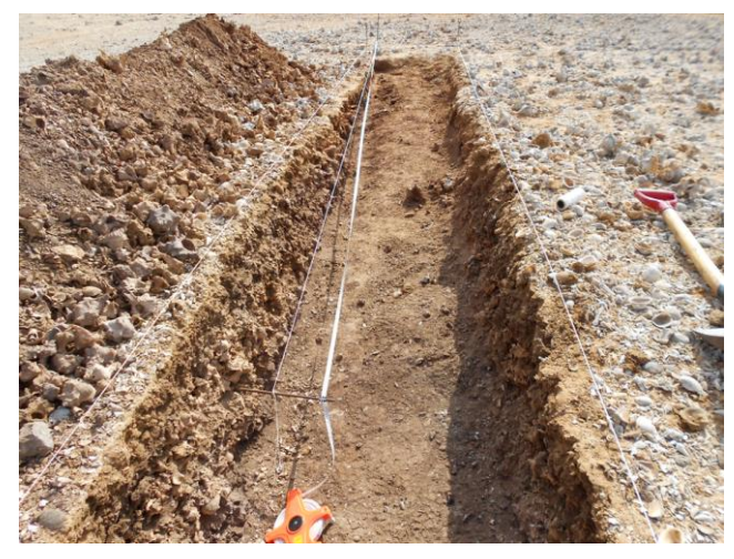
Figure 11. General view of JE5642 excavated trench, looking east. Photo by Niklas Hausmann, 25 January, 2013.