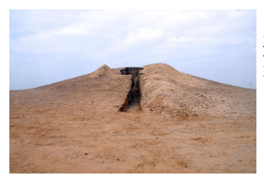
Figure 20. General view of JW1807 after completion of excavations, looking west. Photo by Niklas Hausmann, 23 February, 2013.

JW1807 . A 3m high mound, c. 40m in diameter, located on top of a beach ridge (Figures 20 and 21). A 20m trench was excavated to the centre of the mound, and 115 bulk samples were recovered from three columns. The predominant species is S. fasciatus , and Chicoreus sp. is also present. A pottery sherd was found stratified in the upper layers of the mound.