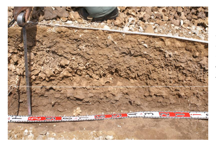
Figure 12. Section through JE5642. Shells of the large gastropod, Chicoreus sp., dominate in the lowermost deposit and near the surface, with shells of Strombus fasciatus more common in the intervening layer.

JE5662 and JE5800 are both scatters deposited onto wind-blown sand behind the modern beach (Figure 13). Both scatters are c. 1m in diameter, and are only one or two shells deep. The dominant shell species is Chicoreus sp., and there is evidence of hearths in both deposits. Two bulk samples were recovered from each site.