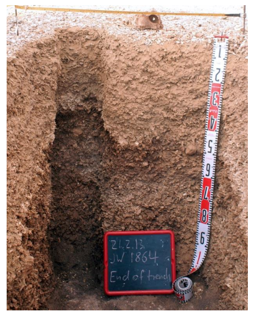
Figure 22. Section through JW1864 after removal of column samples. Photo by Niklas Hausmann, 21 February, 2013.

composed of S. fasciatus with a limited palaeosol preserved under the mound, and resulted in 12 bulk samples recovered from one column in a trench excavated to the centre of the mound (Figure 25).