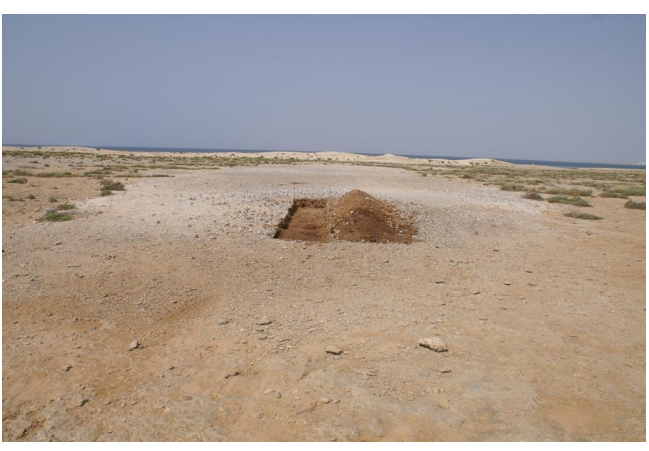
Figure 9. General view of JE5641 after excavation of the trench, looking west. The line of shell mounds distributed along the palaeoshoreline, including JE0086 and JE0087, is visible in the distance. Photo by Niklas Hausmann, 4 February 2013.