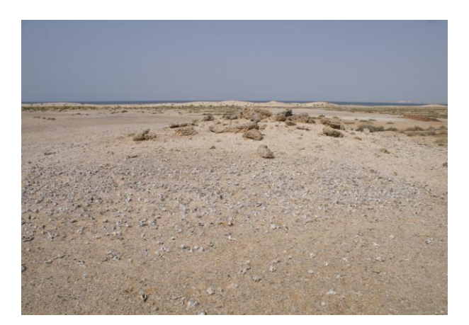
Figure 4. Site JE0097, showing the remains of coral structures on the mound surface, looking northwest. To the right of the image is the spoil heap of red-brown soil from the excavation of JE5641, and the line of larger mounds is visible in the distance. Photo by Geoff Bailey, 4 February 2013.

At the base of JE5656 there is a palaeosol, which also appears beneath JE5641 and JE5642 where the shell deposits have protected it from erosion. This indicates that soil formation in this location occurred before the shell middens started accumulating and may indicate climatic conditions more humid than those present today.