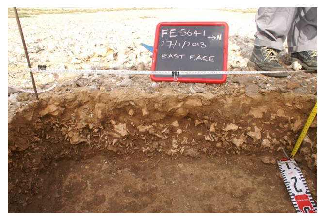
Figure 10. Section through JE5641. The shell deposits sit directly on the fossil coral platform. Photo by Niklas Hausmann, 27 January 2013.