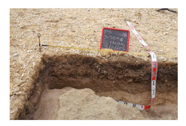
Figure 16. Section through JW5694. Beach deposits are visible at the base of the section. Photo by Niklas Hausmann, 5 February, 2013.

c.15cm of Strombus fasciatus . An in-filled gully runs beneath the site, filled with silt, and locally with Chicoreus sp. A trench 10m was excavated to the centre of this site, resulting in 19 samples from two columns.