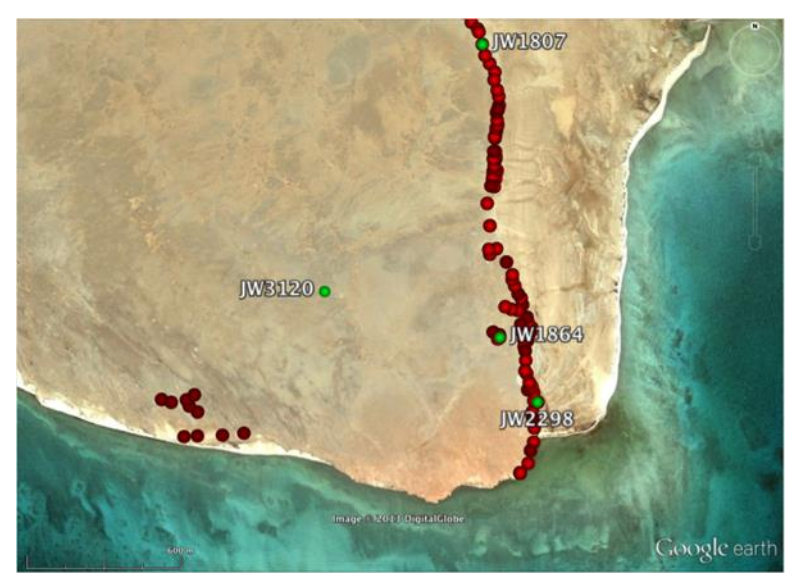
Figure 19. Distribution of shell middens in Janaba West (Southwest) showing those sites selected for excavation. Colour conventions as for Figure 3. Map prepared by Matthew Meredith-Williams.

On the south side of the Janaba West palaeobay, four more sites were excavated (Figure 19). Here the palaeoshoreline is most pronounced, with a clearly identifiable undercut notch, and this appears to become progressively more elevated towards the southernmost end to form a cliff some 2m high. This shoreline has one of the most impressive linear distributions of shell mounds on the whole island, with at least 40 individual mounds including some very large ones, some of which merge into a single line in places. There are no later shell middens on the sand deposits in front of this palaeoshoreline. Two of the large shell mounds on the main palaeoshoreline were excavated, one at the mouth of the palaeobay close to the modern shoreline (JW2298), and one close to the northern end of the linear distribution of sites towards the head of the palaeobay (JW1807). Both of these are large mounds over 2m high. The first inland site excavated is JW1864 – roughly midway along the distribution of linear sites, and set about 100m inland. The other (JW3120) is set back about 500m inland.