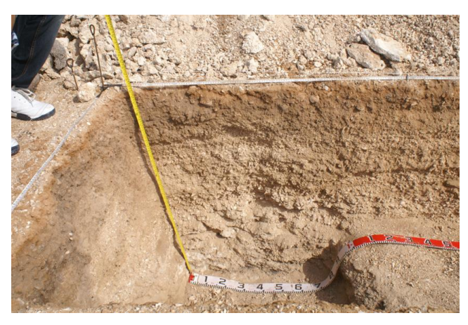
Figure 8. Section through site JE5656. The lower part of the section comprises cemented beach deposit. Photo by Niklas Hausmann, 3 February 2013.