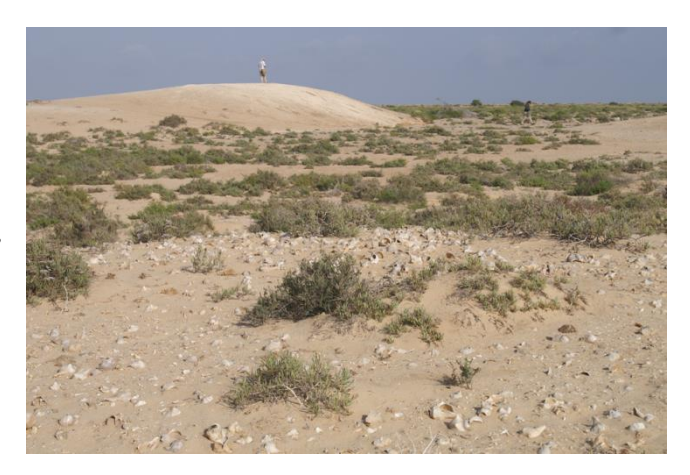
Figure 13. The shell scatter of JE5800 before excavation, looking inland towards one of the larger shell mounds located on the main palaeoshoreline. Photo by Geoff Bailey, 23 January 2013.