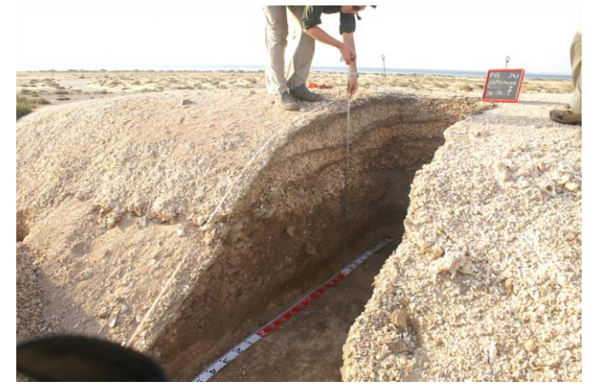
Figure 5. Site JE0078 after the excavation of the main trench and before the removal of column samples. Note the darker lenses of ash and sediment near the top of the section and the predominance of larger gastropods in the lower half of the deposit. Photo by Geoff Bailey, 24 January 2013.