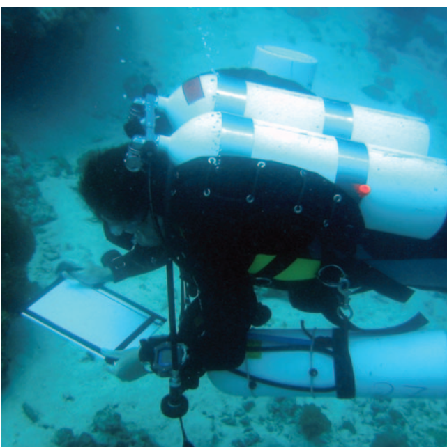
Archaeological trimix diver recording a submerged ancient shoreline in the southern Red Sea

This research brings together archaeologists, many skilled in diving work on submerged sites, geoscientists with access to ships and underwater surveying equipment, governmental organisations charged with managing the underwater cultural heritage, and