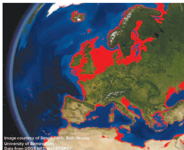
Europe at the glacial maximum, 20,000 years ago, showing extra land (in red)

continuous sedimentary records of climate and sea level change, and geological structures are more easily observed.