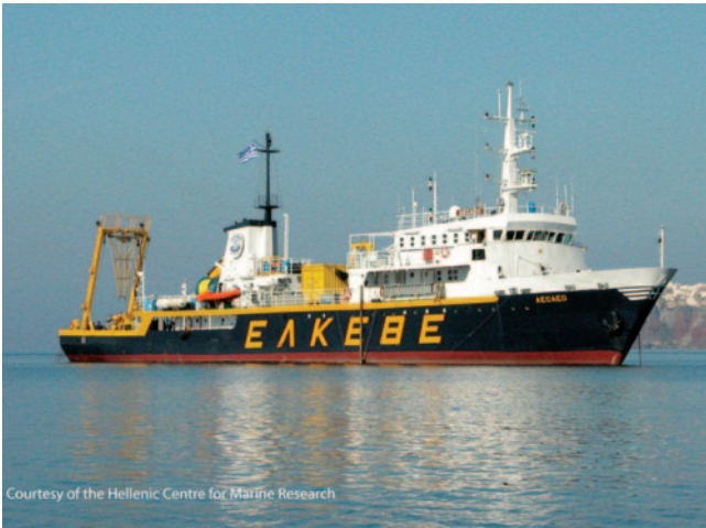
RV Aigaio, specially equipped for underwater landscape survey

follow that most of the archaeological evidence of our deep history now lies on the seabed.