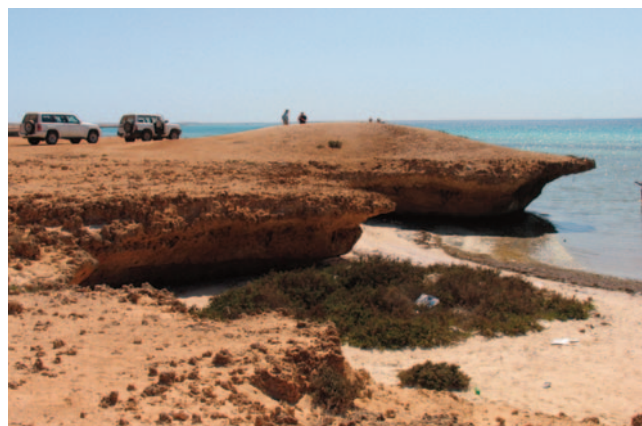
Fig. 4 5,000-year old shell mounds on the modern shoreline provide clues on where to search for earlier underwater settlements at periods of lower sea level

developing a pan-European network of expertise, technical resources, collaborations and funding proposals. Simultaneously, an ERC Advanced Grant – DISPERSE (Dynamic Landscapes, Coastal Environments and Human Dispersals), is exploring the tectonic history of rift systems extending from Africa to Anatolia and the early archaeology and submerged landscapes of the Red Sea and the Arabian Peninsula.