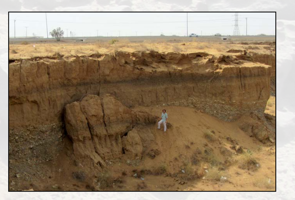
Figure 3: Stratigraphy in quarry, lower coastal plain.

The highly eroded, steep slopes of the escarpment and other