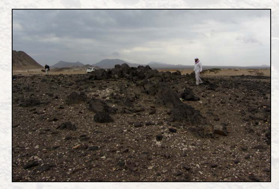
Figure 4: Raw material outcrop in area of exposed basement rock associated with multi-period lithics.

Figure 3: Stratigraphy in quarry, lower coastal plain.